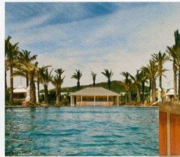
To hell with the Costa: lavish Andalusian luxury is enough to make Finca Cortesin stand out from the crowd on Spain's most well-travelled coast

Perched atop a 30-metre cliff, each of the Bellevue's 91 rooms has a sea view that makes you weep. Spacious balconies, a private beach, a restaurant with some of the best John Dory GQ has sampled, the warm Adriatic rolling in, superb spa treatments – the Bellevue will have you (and her) horizontal before you know it. JH ROOMS FROM £107 PER NIGHT. HOTEL-BELLEVUE.HR EASYJET FLIES TO DUBROVNIK, FROM £70 RETURN. EASYJET.COM